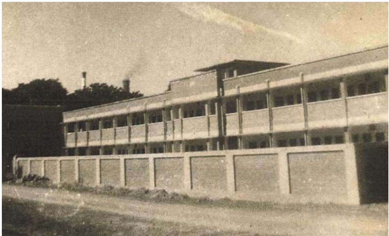
The first student hostel at Government Central Textile Institute (GCTI)