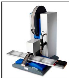
LCP Mosquito, high-throughput robotic set-up for crystallisation of membrane proteins

Department of Biological Engineering and Biosciences received a similar Level II FIST grant of Rs. 4.86 crores to augment research infrastructure and initiate new lines of investigations in molecular and structural biology by installing a high-end Fluorescence-Activated Cell Sorting (FACS), a next-generation sequencing system, a robotic device for crystallisation of membrane proteins. Additionally, a high-resolution micro-computed