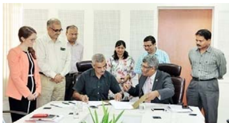
MoU signing with University of Calgary

collaboration in academic and research activities. The list includes the University of Melbourne, University of Technology of Troyes, Ecole Centrale De Nantes, National Research Tomsk Polytechnic University, KTH Royal Institute of Technology, Lund University, Luleå University of Technology, McMaster University, University of Calgary, University of Ontario, University of Texas at Dallas, University of Miyazaki, National Ilan University (NIU), Chulalongkorn University, The Nelson Mandela African Institution for Science and Technology.