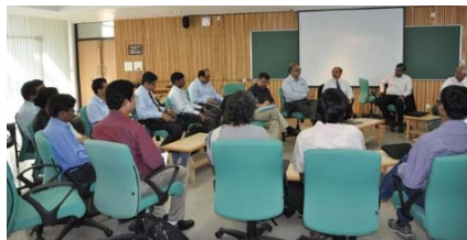
Interaction with TCS Scientists