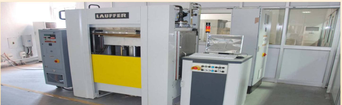
Multi-layer PCB Compaction Press