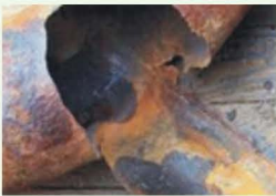
Typical Failure of a Gas Pipe Line

D ue to corrosive environment, pipes used for transportation often