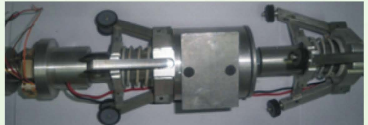
The proposed New Robot based on PVDF Sensor

the usability of a new PVDF based cantilever smart probe as a sensor to sense finite sized discontinuities over a surface using the pipe crawler robot. It is envisaged that this novel sensing system could be used effectively for pipe health monitoring.