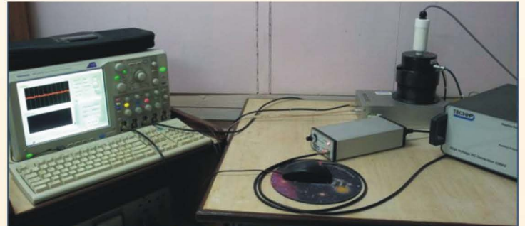
Experimental facility: Pulsed Electro-Acoustic Technique for space charge measurement in polymers.

for prediction of ageing and breakdown in insulating materials, in terms of space charge dynamics.