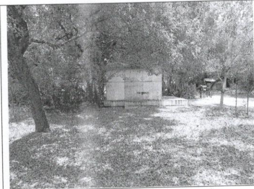
Fig.1 Picture of the area to be developed.